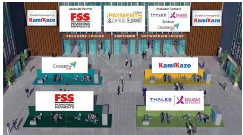
VIRTUAL EXHIBITION AREA